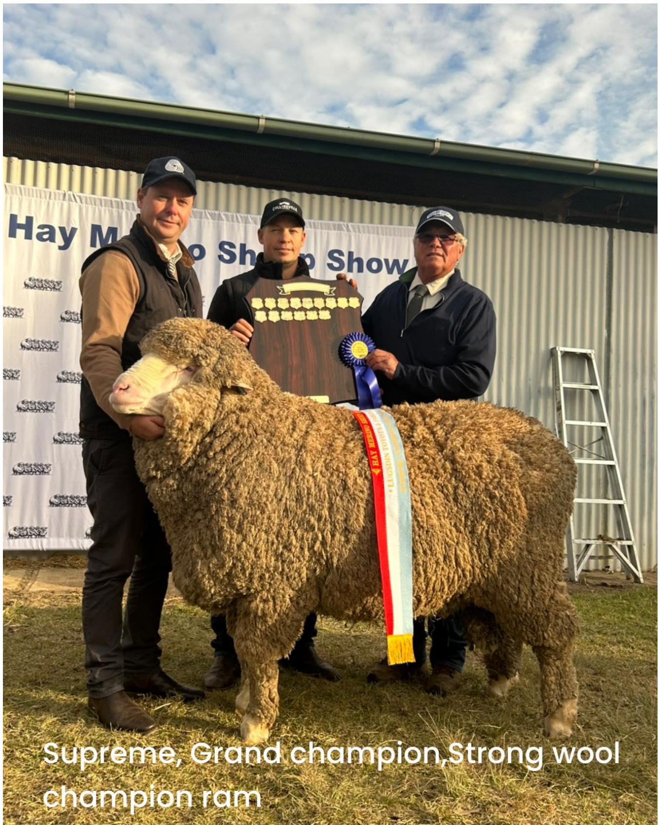
Supreme, Grand champion, Strong wool champion ram