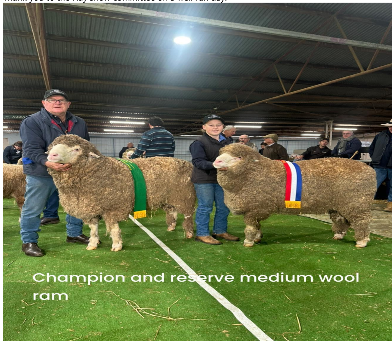
Champion and reserve medium wool ram

Thank you to the Hay show committee on a well run day.