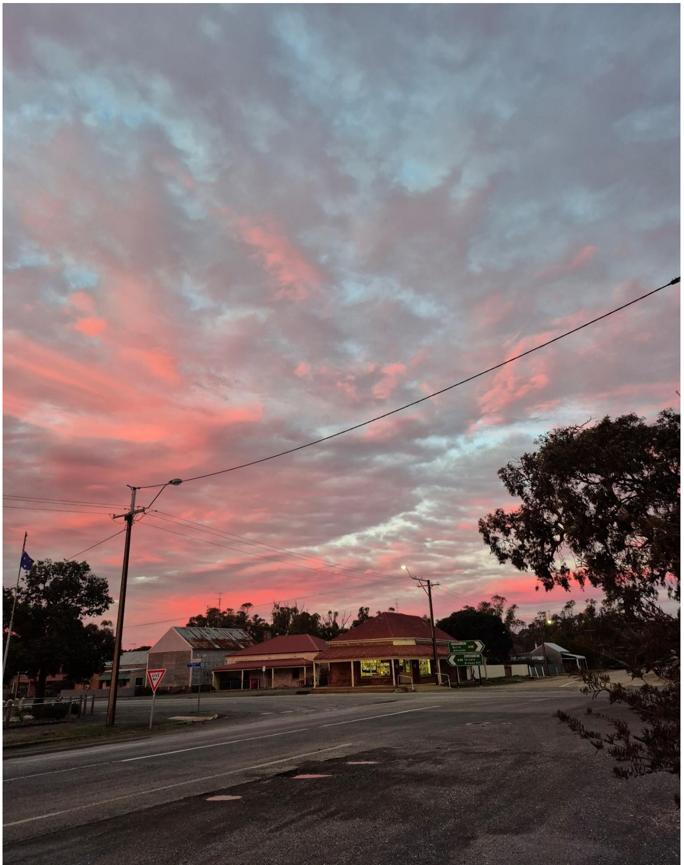
Hallett, beautiful from any outlook